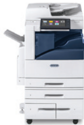
Xerox® AltaLink® C8030/C8035/C8045/ C8055/C8070 Colour Multifunction Printer