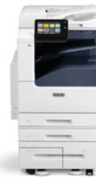
Xerox® VersaLink® B7025/B7030/B7035 Multifunction Printer