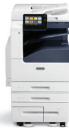
Xerox® VersaLink® C7020/C7025/C7030 Colour Multifunction Printer