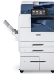
Xerox® AltaLink® B8045/8055/8065/ 8075/8090 Multifunction Printer

To learn more about ConnectKey Technology, go to www.xerox.com .