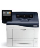
Xerox® VersaLink® C400 Colour Printer