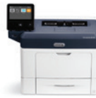
Xerox® VersaLink® B400 Printer