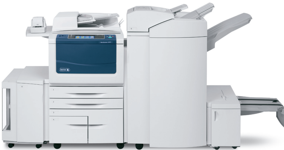
WorkCentre 5875 shown with optional High Volume Finisher with Booklet Maker, Z Fold /C Fold Unit, Post Process Inserter, Convenience Stapler with Work Surface and High Capacity Feeder.

Productivity Convenience Security Cost Control