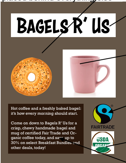
Document with "paper-substitute" placed behind everything else

Shop name is a bitmap in the original file. Re-creating it using text or as a vector-art object allows the surrounding area's paper to show-through.