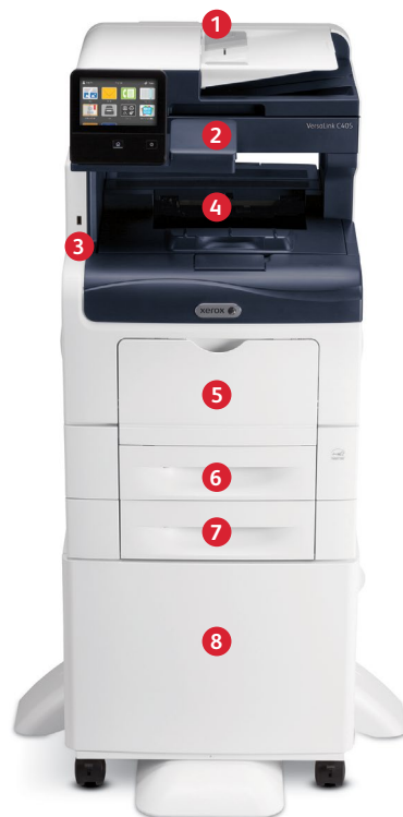
Xerox® VersaLink® C405 Color Multifunction Printer Print. Copy. Scan. Fax. Email.