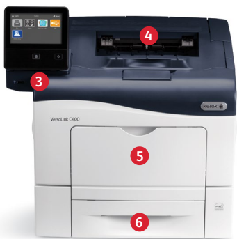
Xerox® VersaLink® C400 Color Printer Print.