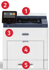
Xerox® VersaLink® B610 Printer Print.