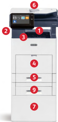
Xerox® VersaLink® B615 Multifunction Printer Print. Copy. Scan. Fax. Email.