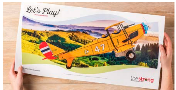
Extra-long sheet printing – maximum paper size 330 x 660 mm

It all adds up to better margins, higher profits and the ability to grow strategically with a single, future-proof investment.