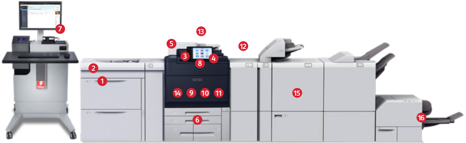
Shown: Fiery® EX Print Server, Two-Tray Oversized High Capacity Feeder, Xerox® PrimeLink® C9200 Series Printer, Crease and Two-Sided Trimmer, Xerox® Production Ready Booklet Maker Finisher, Xerox® SquareFold® Trimmer