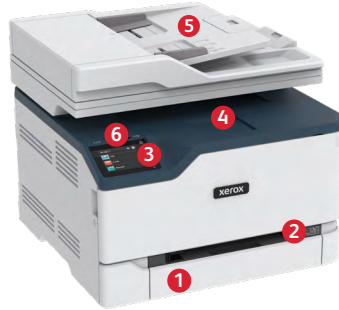
Xerox C235 Color Multifunction Printer