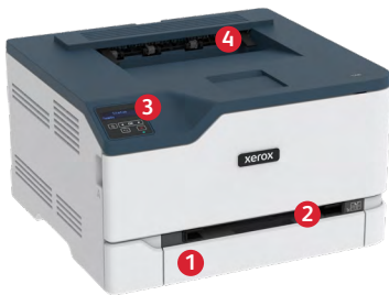
Xerox C230 Color Printer